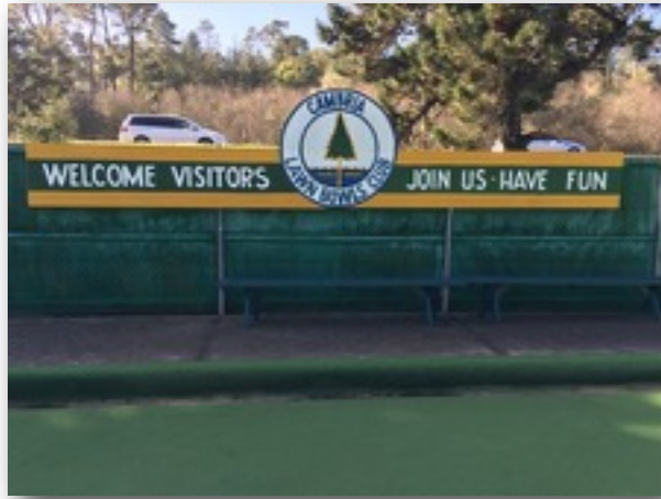
Lawn Bowls' newly painted sign.