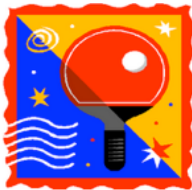
TABLE TENNIS CLUB

COME BOWL WITH US! Beginners always welcome! Monday, Wednesday, Friday, Saturday