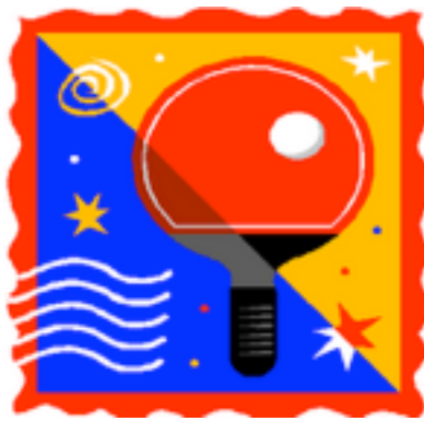
TABLE TENNIS CLUB

COME BOWL WITH US! Beginners always welcome! Monday, Wednesday, Friday, Saturday