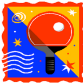
TABLE TENNIS CLUB

Welcome to Table Tennis at the Joslyn Center.